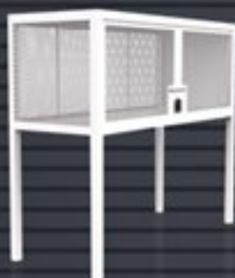
"Active" Storage Locker - A1