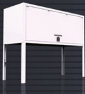
Storemaster Storage Locker - S1