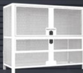
Double Decker locker- S1D and A1D